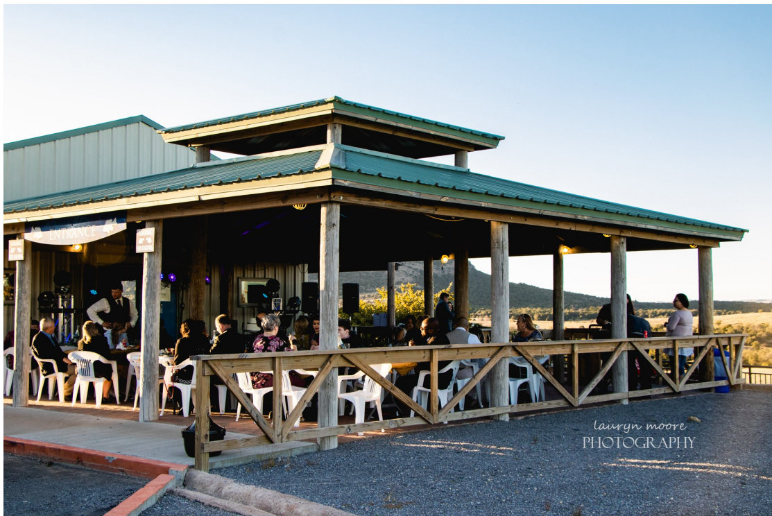
The covered patio is just outside the gift shop entry.

The covered patio, welcome room and the outdoor event space are most commonly used for events.