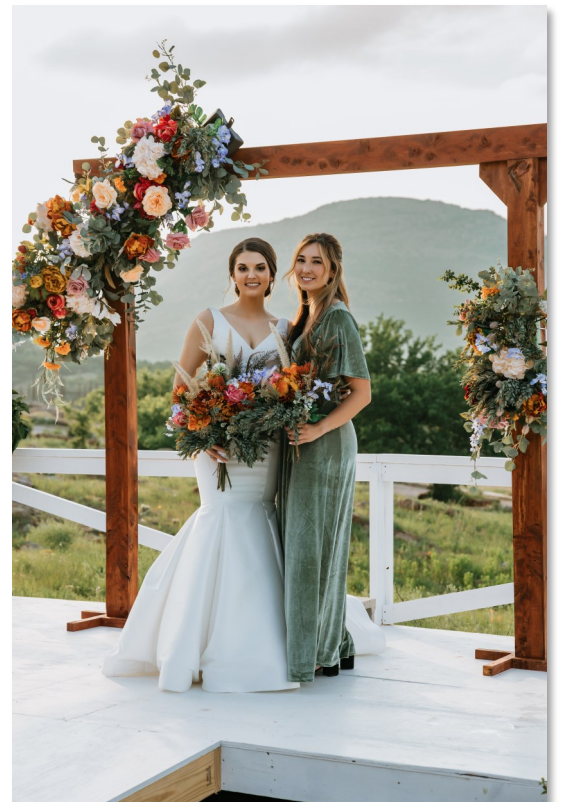
Mount Scott views

Half of the package cost is due at the time of booking as a deposit to secure your date. The balance is due ten days prior to the event.